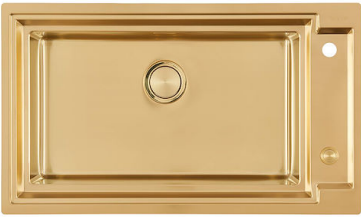
OUTLINE GOLD 6602 009